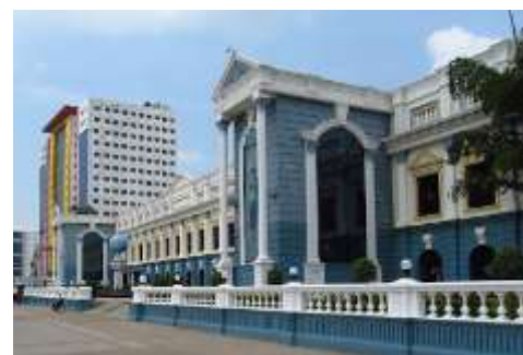
Dr. T. P. Ganesan Auditorium

For More Information, please contact +91 8220322594, +91 7418343361, +91 9025558062.