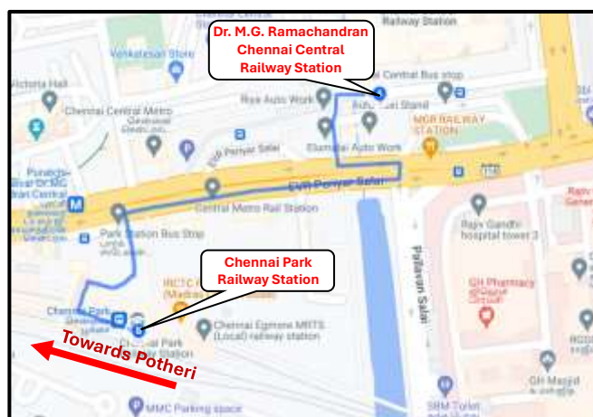
Map of Dr. M. G. Ramachandran Chennai Central Railway Station