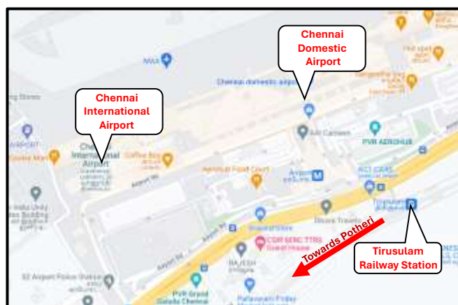
Map of Chennai International Airport