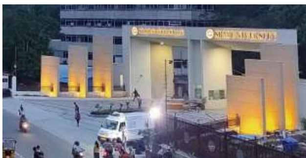
Gate No. 4 Main Campus